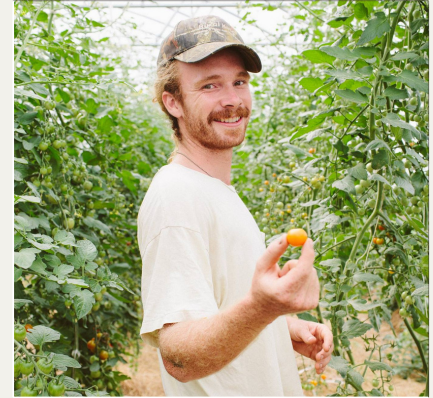
GROWING LOCAL FOOD IN WHEELING