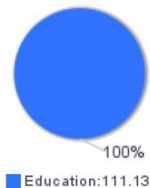
Table 1: MSYs by Focus Areas